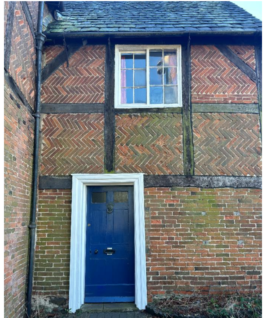
Image 16: The Manor, detail showing herringbone brick pattern, later inserted door and surround and vertical sliding sash window.