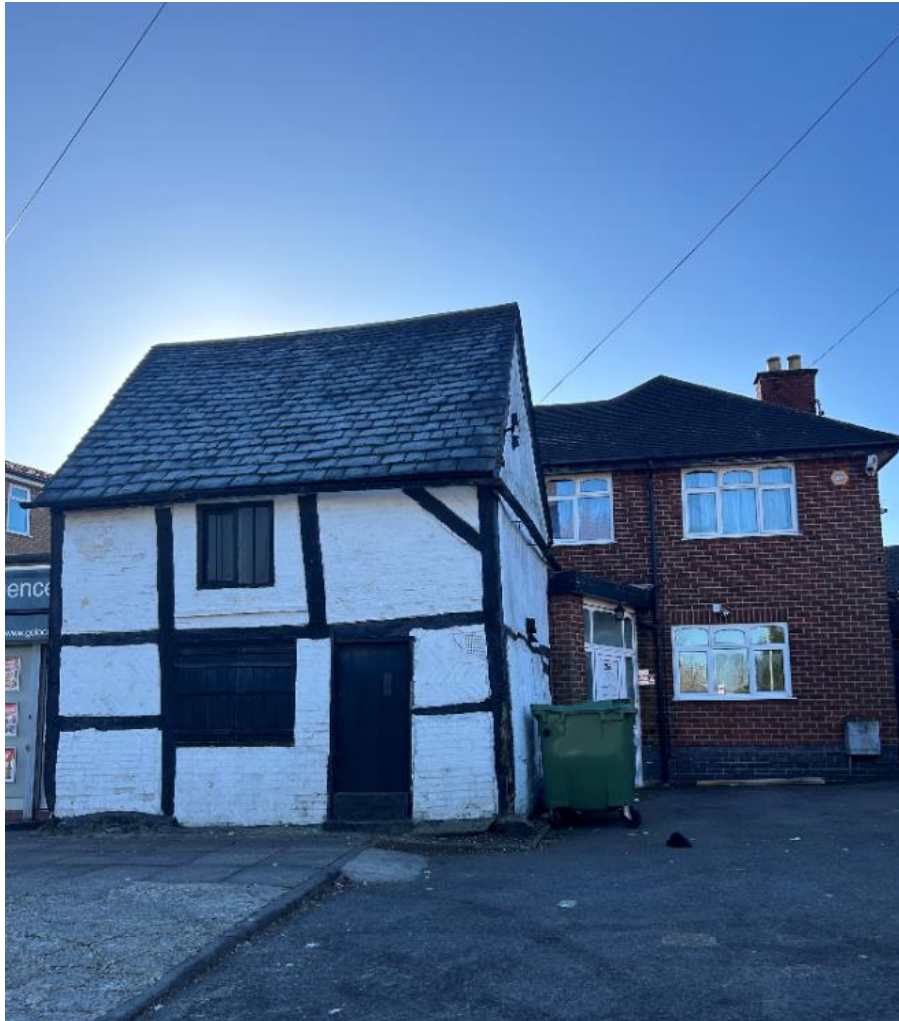
Image 12: Grade II Listed Former Shop with Storage Loft at 266 Braunstone Lane.

herringbone pattern and there is a mix of window styles throughout the property including both vertical and horizontal sliding sashes. The Manor was Grade II listed in 1952.