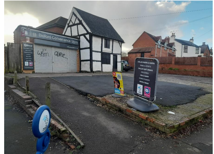
Images 24 & 25: Issues with boundary treatments and hard landscaping, as well as traffic on Braunstone Lane.