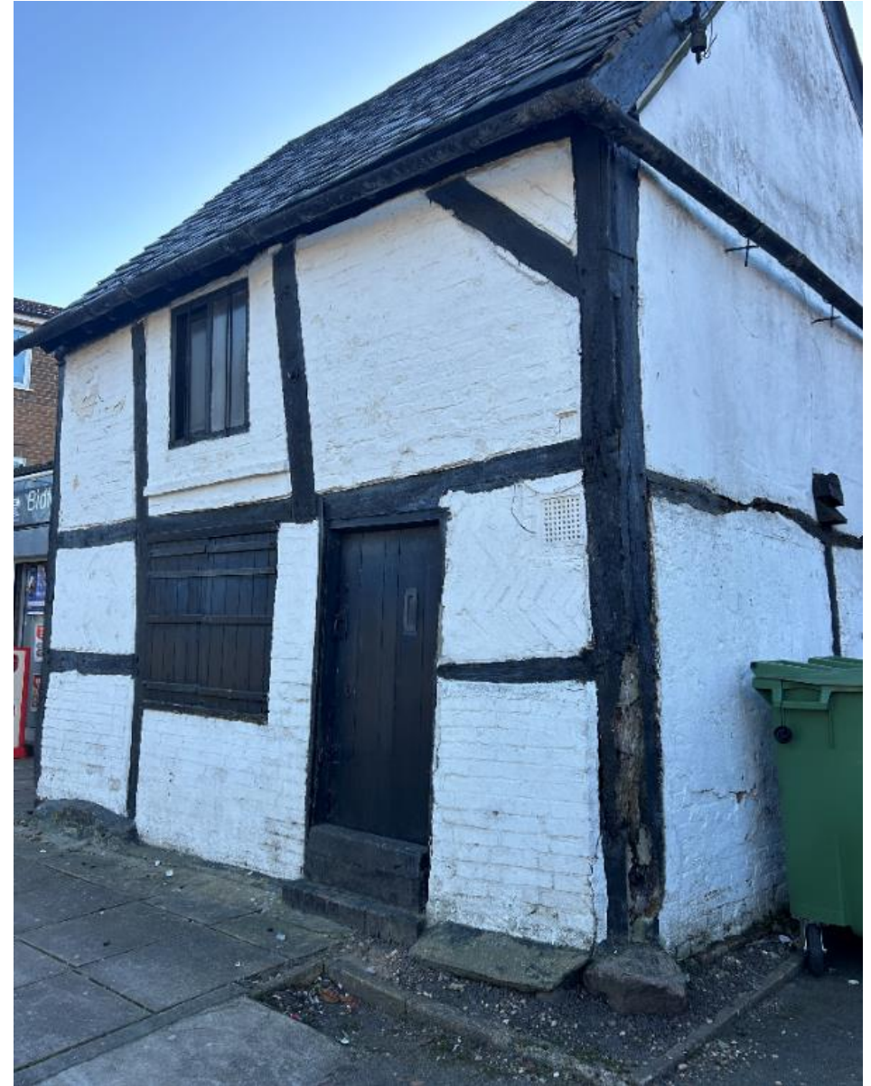
Image 20: Traditional materials use in the building with less cohesive floorscape materials below the plinth.