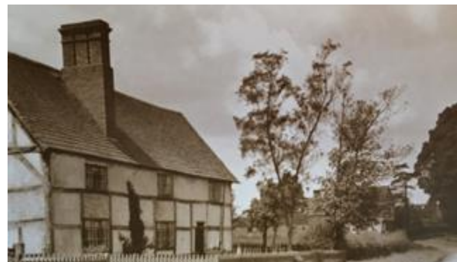
Image 7: Historic photograph of a farmhouse on Braunstone Lane, now demolished. The Manor is visible in the background.