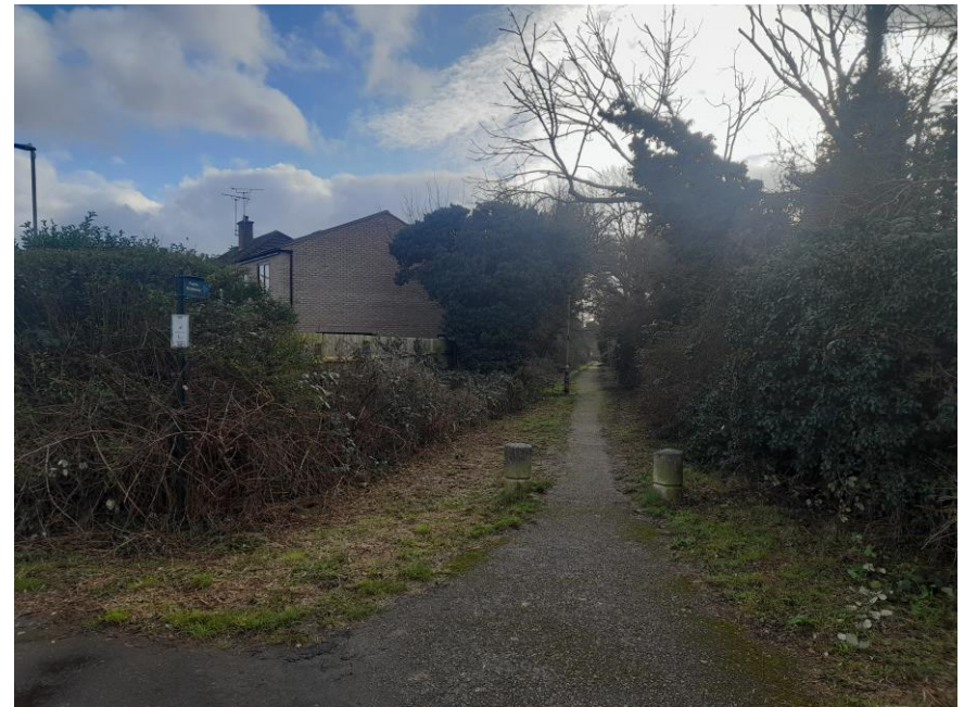
Image 23: View looking south from Avon Road down the public footpath below Shakespeare Park.