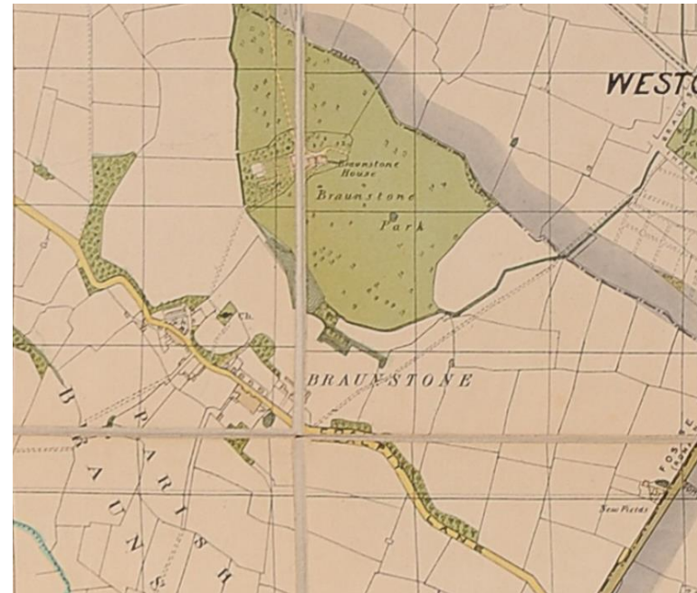
Image 3: Gibbons Map (1903) showing village in context with Braunstone Hall and Park.