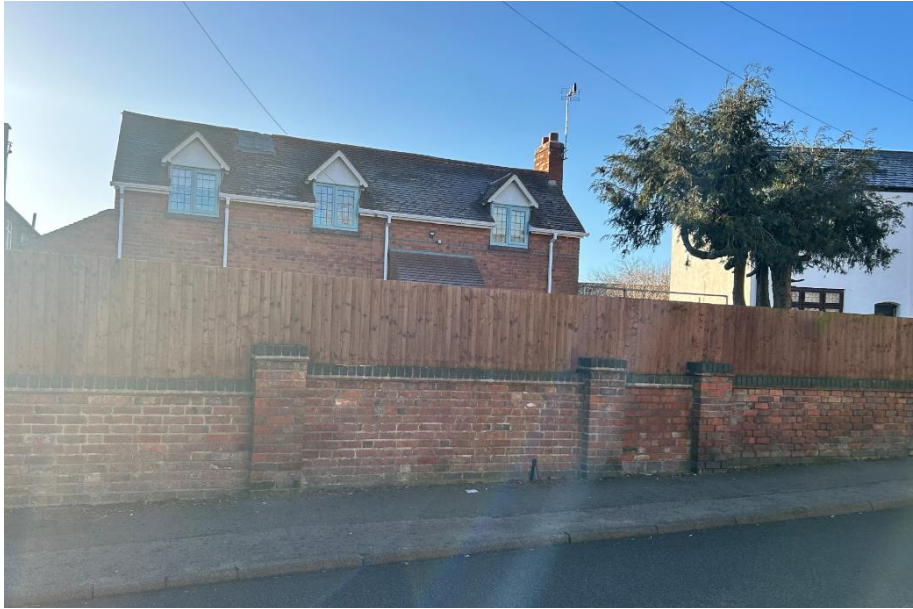
Image 18: Mixture of more and less traditional boundary treatments.