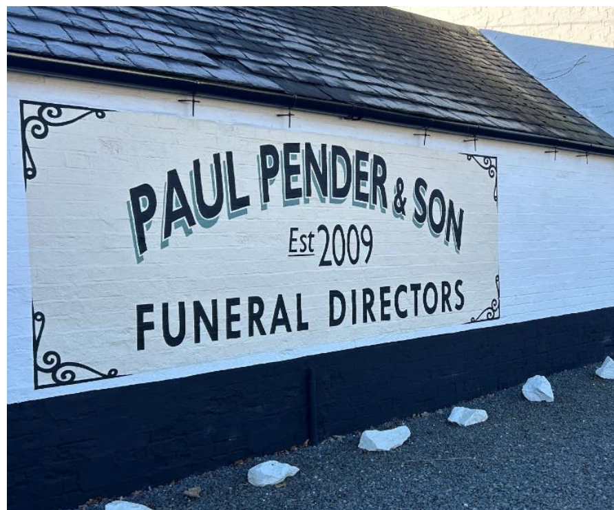
Image 15: Painted signage advertising Paul Pender & Sons Funeral Directors.

cohesive signage scheme which allows for the advertisement of the business while respecting the sensitive heritage setting. They have utilised a combination of contemporary and traditional painted techniques which balances well the needs of the business and the appearance of the building (Image 13). Notably, the former pub sign has been retained and sensitively amended, preserving this element of the building's history.