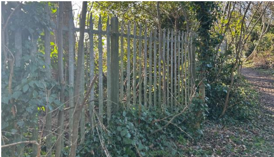
Image 19: Natural vegetation dominates along the public footpaths with more utilitarian fencing.